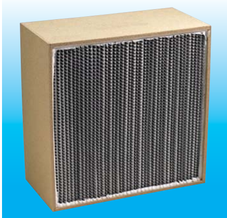
Style VFA - Box Construction (No header)