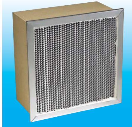
Style VFB - Single Header