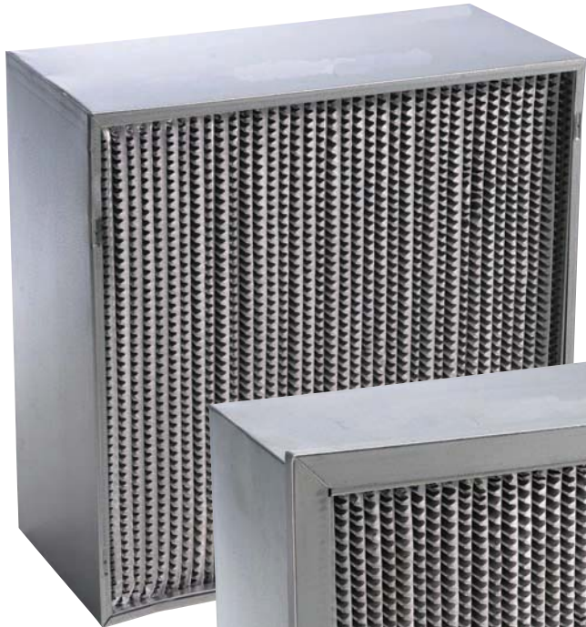
Box Construction (No header)