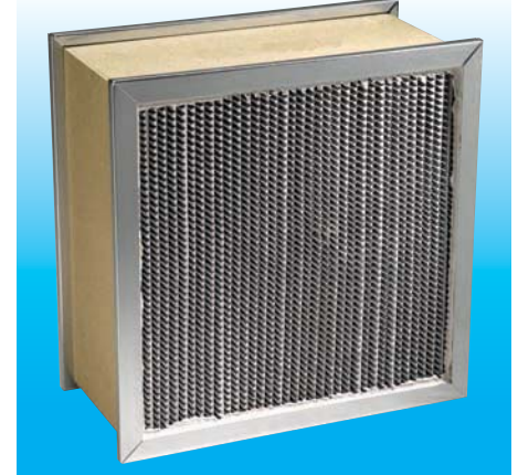
Style VFC - Double Header